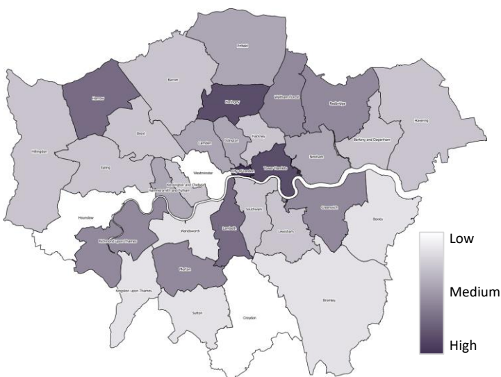
Map illustrating backlog for all highway assets (per km) by borough.

If the government is not willing to fund highways maintenance directly, then it must allow London local government greater control over its own assets and taxes. It should therefore look again at the recommendations of the London Finance Commission.